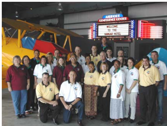
The DOIM Crew 5-7-04

THE INFORMATION RECEIVED AND EXCHANGED HAS ALREADY HELPED. I THINK THAT BEING A PART OF THE OFF-SITE HAS GIVEN ME THE INSIGHT AND THE COURAGE TO DEAL MORE OPENLY ABOUT PROBLEMS AND CONFLICTS WITH MY CO-WORKERS.