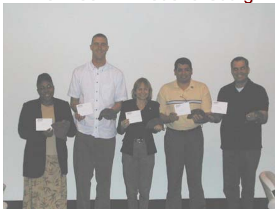
The Yellow Team takes the Gold